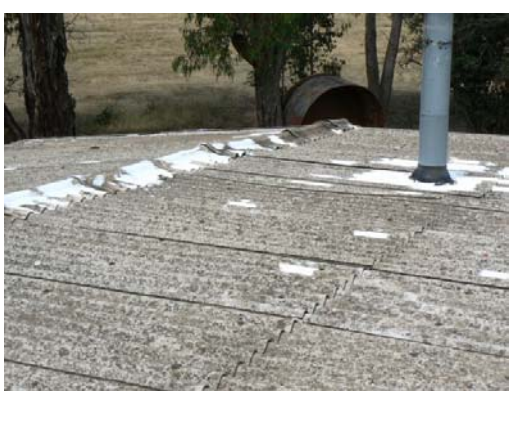
Before shots – cracked asbestos roof