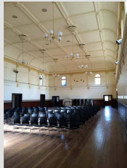
Melbourne's - Kensington Town Hall Ballroom [C1900] now beautifully restored